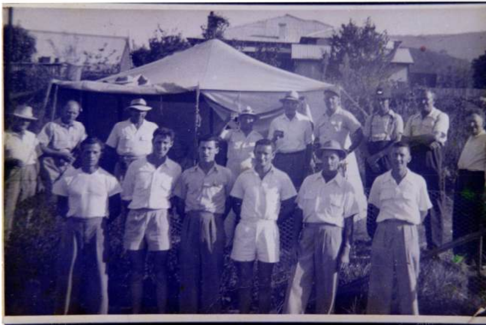
The first Clubhouse, a NSW Railways tent.