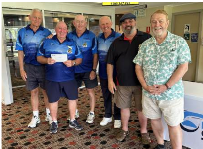
November Diggers Day at Figtree sponsored by Wollongong RSL.