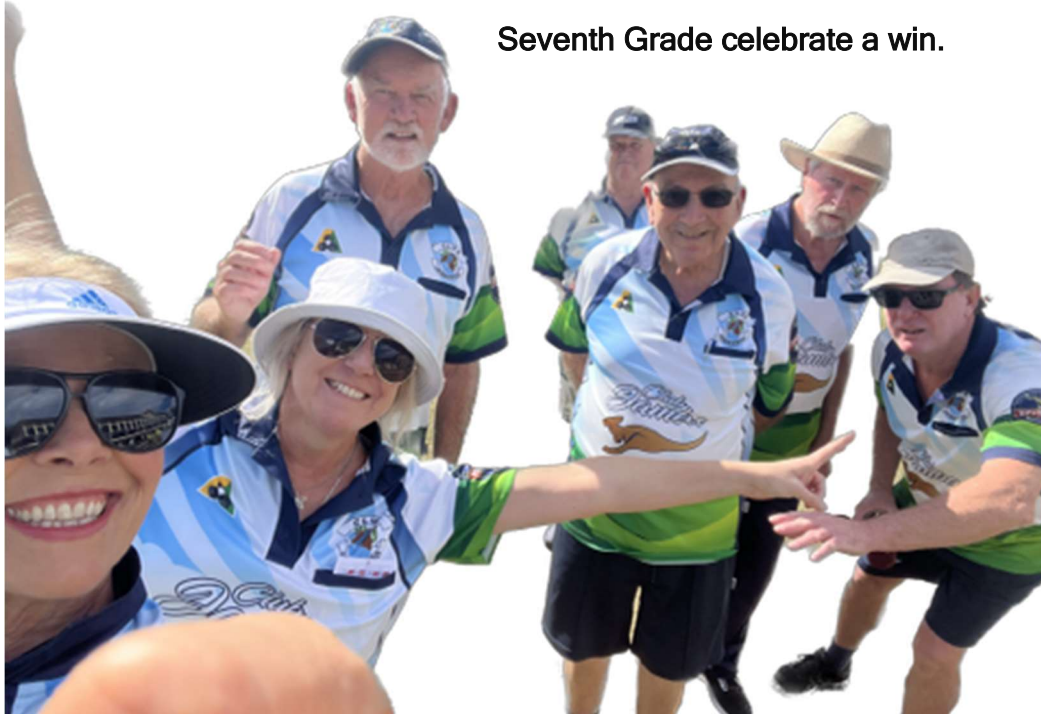
Seventh Grade celebrate a win.

Round 6 at Windang with a great victory to Jamberoo, 75-46, all rinks winning to get the 10 points. Round 7 was a home game against Gerringong. Unfortunately, they were too good on the day 85-37. Round 8, the selectors decided to change things up