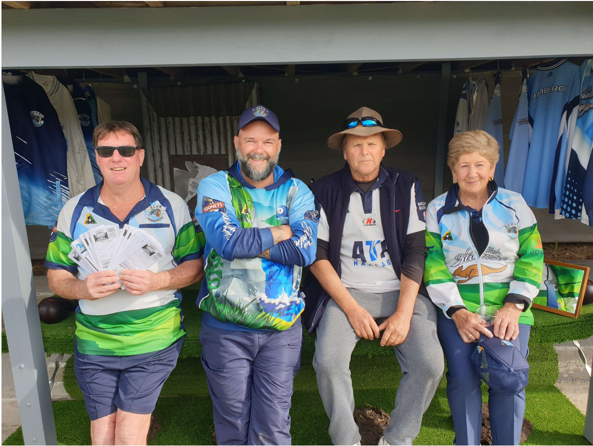
Cowdung Cup Organizing Team